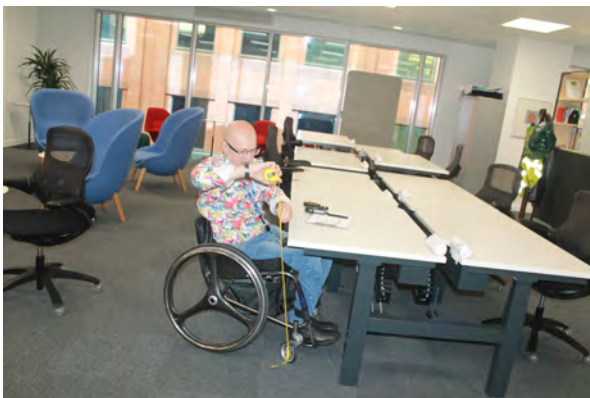
▲ Measuring the height of the desks.

Leonard Cheshire undertook an access audit, collaborating closely with The Health Foundation to identify areas of good practice, potential adjustments, and inclusive design opportunities. The audit also helped The Health Foundation to comply with statutory access standards and minimise barriers and stigma for staff and visitors in the workplace.