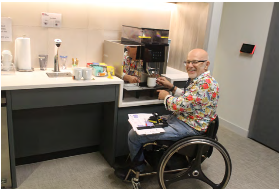
▲ Testing wheelchair access to hot drink machine

“The Health Foundation is committed to embracing equity, diversity and inclusion by building and sustaining an open, inclusive and supportive environment which affirms the rights of individuals to be treated equitably and with respect. The detailed report and recommendations provided by Leonard Cheshire will help us to ensure that our physical workspace aligns with this commitment.”