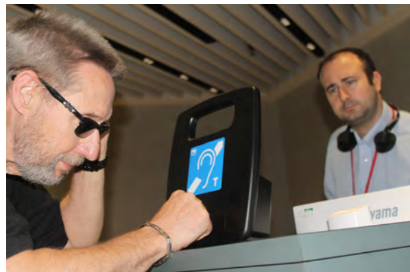
▲ Testing induction loop with hearing aids.